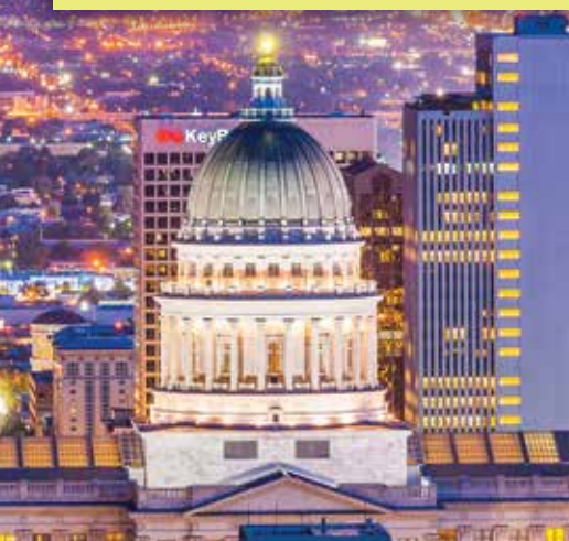
Capitol Hill, Salt Lake City

Day 15: Transfer independently to the airport for your return flight.