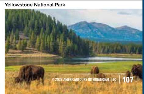
Yellowstone National Park